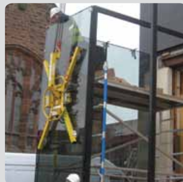
MRT4 with G20 Pick & Carry crane see page 245