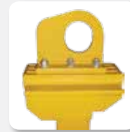
Adjustable suspension eye