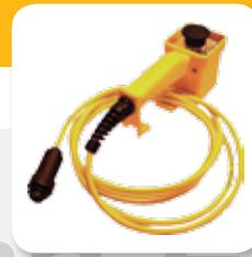
Cable remote control as standard